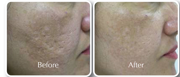
Use of ENERPEEL® on facial hyperpigmentation and scarring

Enerpeel® Eyes and lips is specifically designed for treating in and around the eye socket and the lip margin; the two age defining areas of the face.